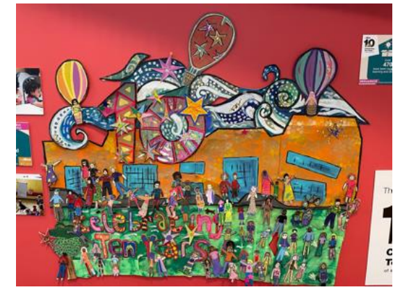
Community artwork in the childrens' library

New members of staff have revitalised The Hive events programme and are building links with members of the university to extend our reach into the community. Throughout the early part of the year we celebrated 10 years of The Hive's successful partnership between County Council and University, culminating in a very well attended community day on 2<sup>nd</sup> July, the 10<sup>th</sup> anniversary of opening. We have held public lectures and workshops, film viewings, childrens' activities and much more. Students tell us that using a joint library helps them feel part of the wider community and are interested in volunteering and work placement opportunities.