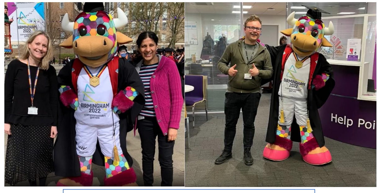
Aston University Library staff with Perry the Bull.

We enjoyed a very hot Summer in Birmingham during the time when Aston was proud to be an official University partner of the 2022 Commonwealth Games and we had the pleasure of many visits from the official mascot 'Perry the Bull' who had his own library card and changing room in the library.