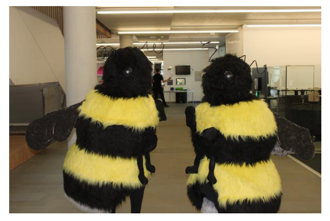
Our welcoming bees were very popular!

We are trialling our Study Happy and online enquiries services to sixth formers and GCSE students using public libraries county-wide which we hope will be a valuable service as well as promoting the University to potential applicants.