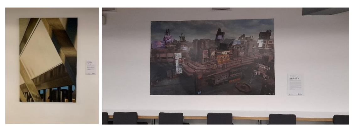
New works of art installed in the Library building